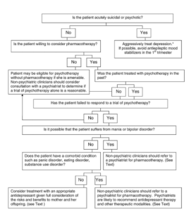
Fig. 2. Patient is in episode of MDD, is pregnant and is not taking antidepressants.