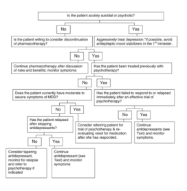
Fig. 3. Patient with MDD who is pregnant and currently taking antidepressants.