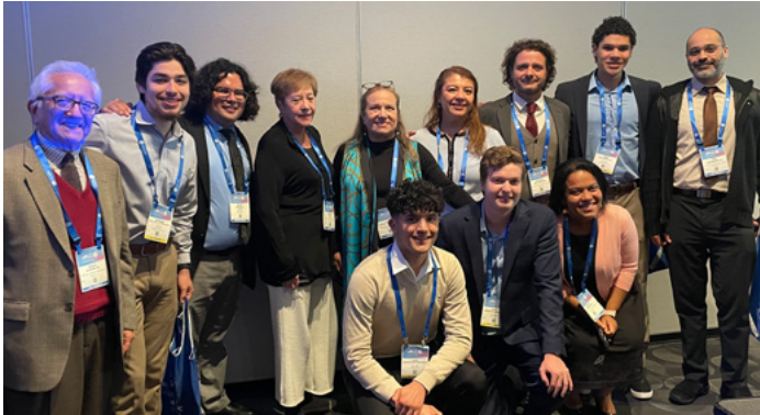
Next generation psychiatrists attending the session.