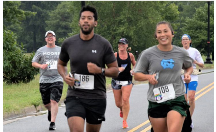
Runners at the APA MOORE Equity 5k in 2022

For help getting started, email moore@psych.org , or join your team and captain with the following QR Code or team inks: